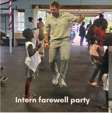
Intern farewell party