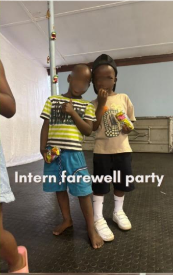
Intern farewell party