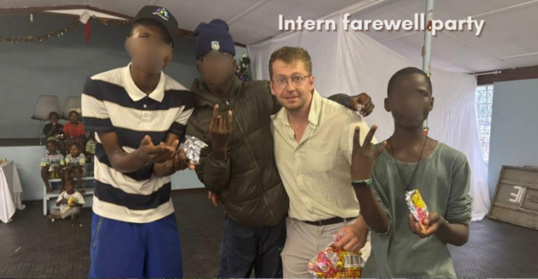
Intern farewell party