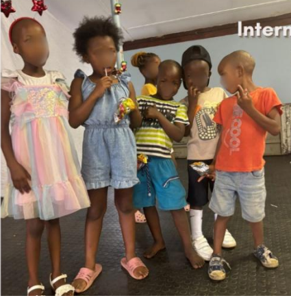
Intern farewell party